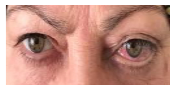
Figure 1. Chemosis and conjunctival hyperemia in the left eye at the time of the patient's admission

(ICA), the meningeal branches at the level of the cavernous segment and the cavernous sinus. There was a 4x3 mm incidental