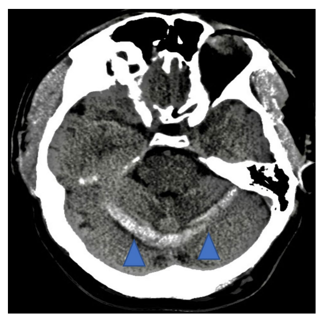
Figure 1. An axial section of the brain computed tomography displaying bilateral cerebellar hyperdensity corresponding to hemorrhage.

further management of persistent elevated blood pressure and close neurological monitoring. A CT angiogram of the head and neck was negative for aneurysms or vascular malformations. Workup of other underlying comorbidities included hemoglobin A1c, lipid panel, liver function test, and renal function, which were within normal limits.